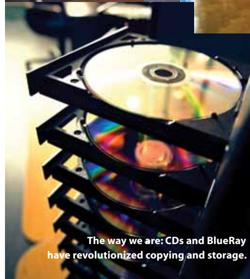
The way we are: CDs and BlueRay have revolutionized copying and storage.