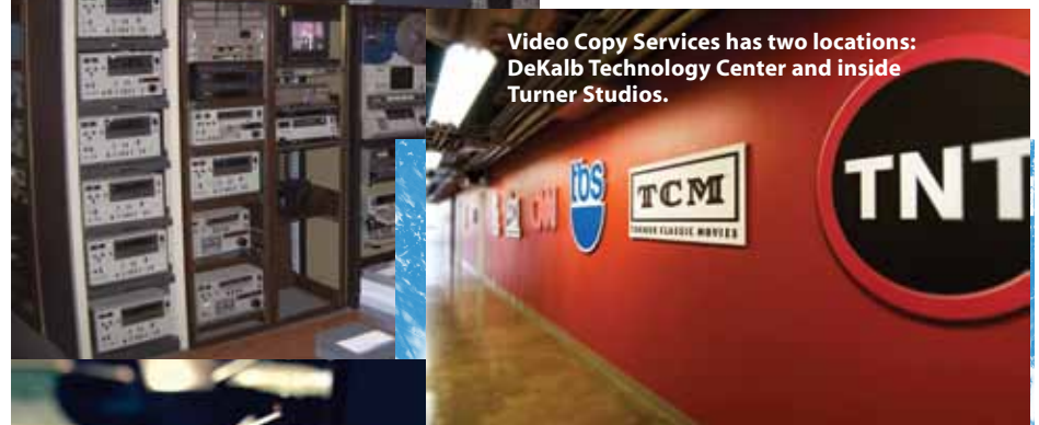
Video Copy Services has two locations: DeKalb Technology Center and inside Turner Studios.